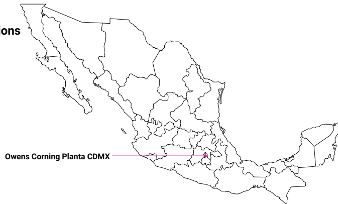
Figure 1 - Owens Corning® Duct Wrap LF® Plant Locations

To view other Owens Corning® products that help contribute to LEED® certification please visit sustainability.owenscorning.com