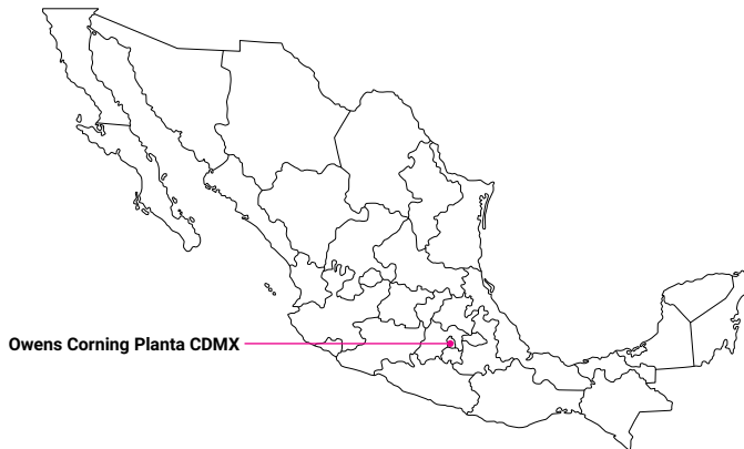
Figure 1 - Owens Corning® Serie 700 Fiberglass® Plant Locations

To view other Owens Corning® products that help contribute to LEED® certification please visit sustainability.owenscorning.com